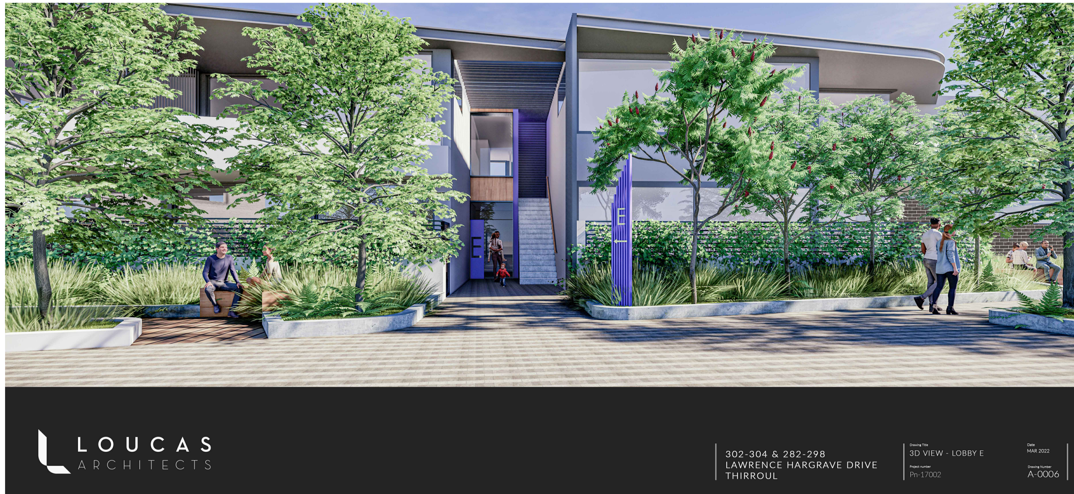
03 LOBBY E - VIEW 02 (LOBBY D SIMILAR) NTS