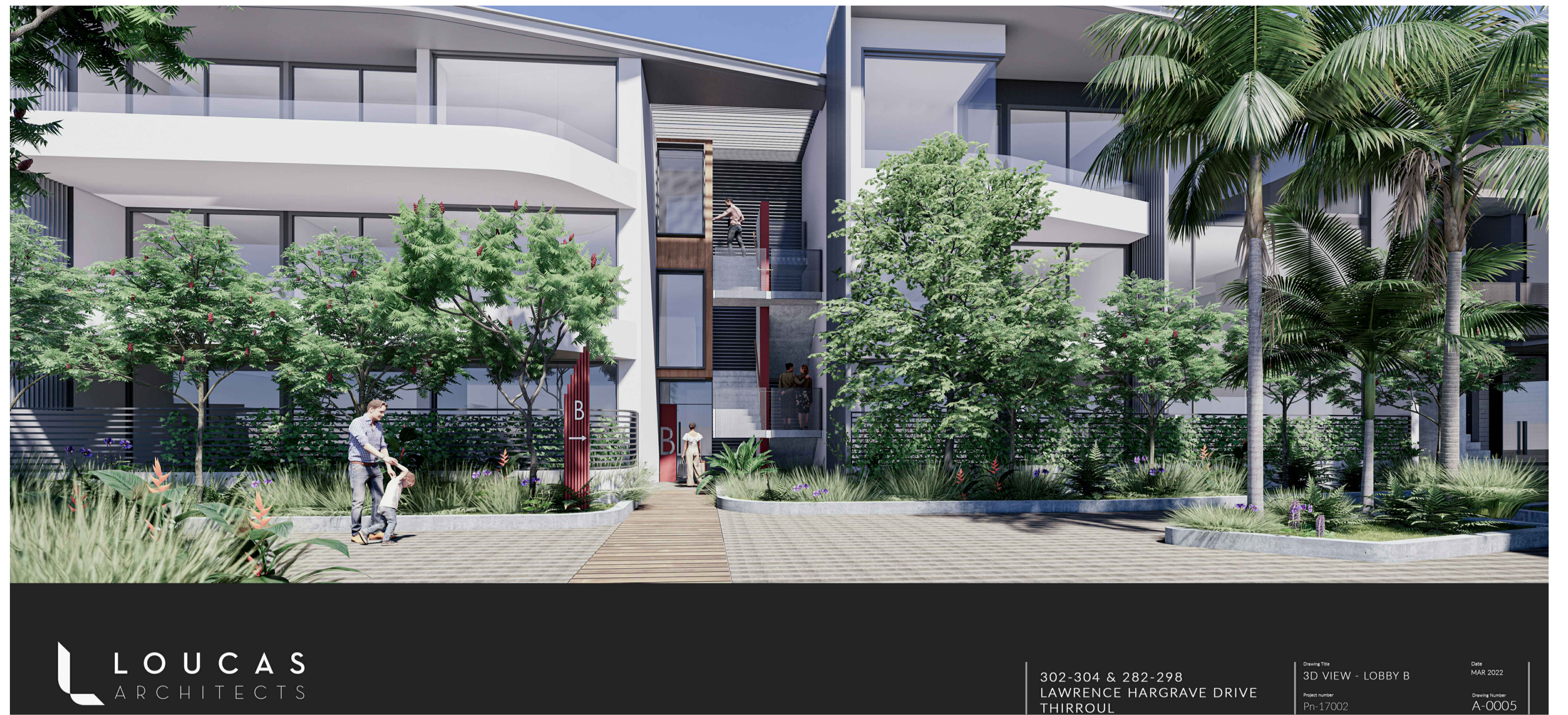
02 LOBBY B - VIEW 01 NTS