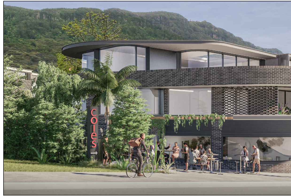
01 SIGNAGE 1 - COLES TOTEM SIGN NTS