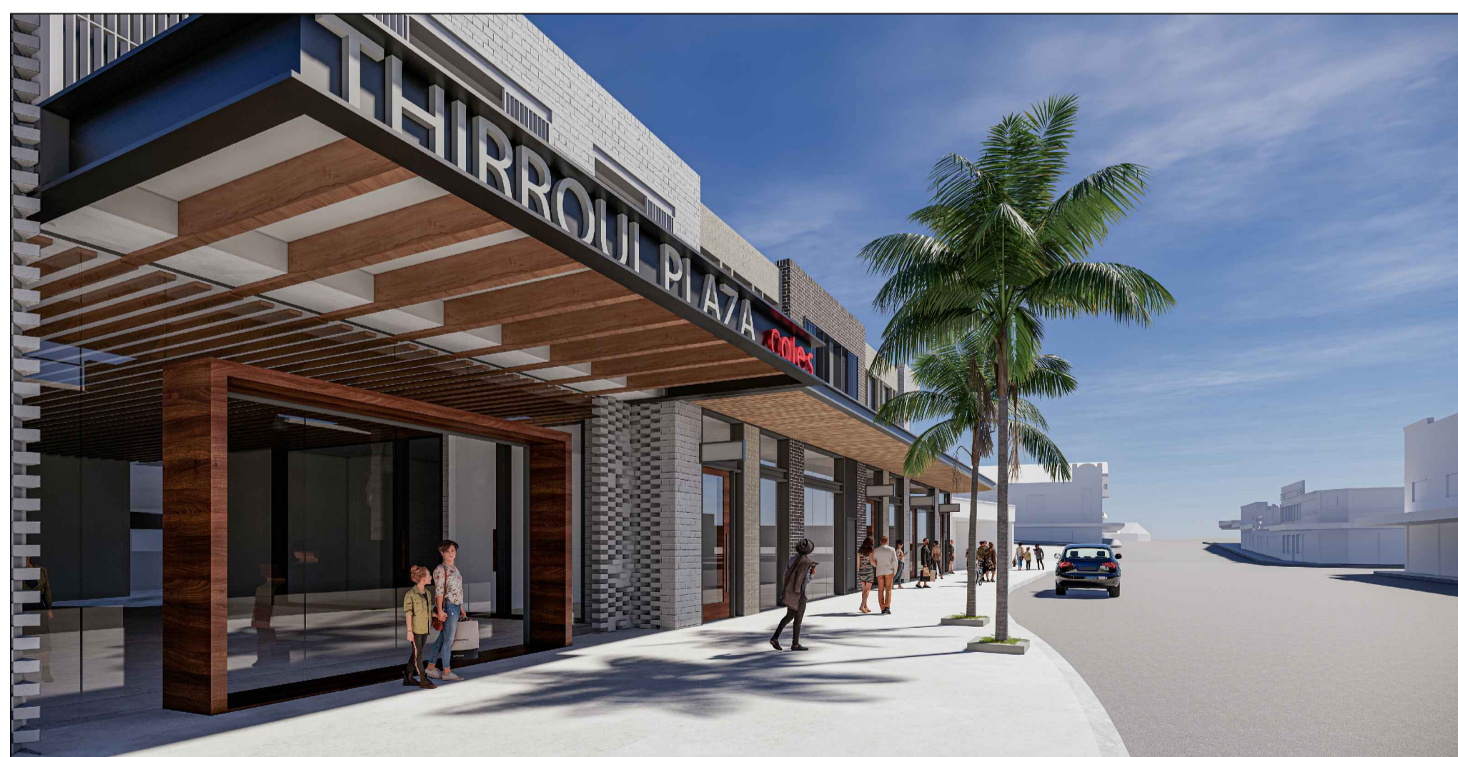
03 SIGNAGE 3 - SHOP FRONT NTS