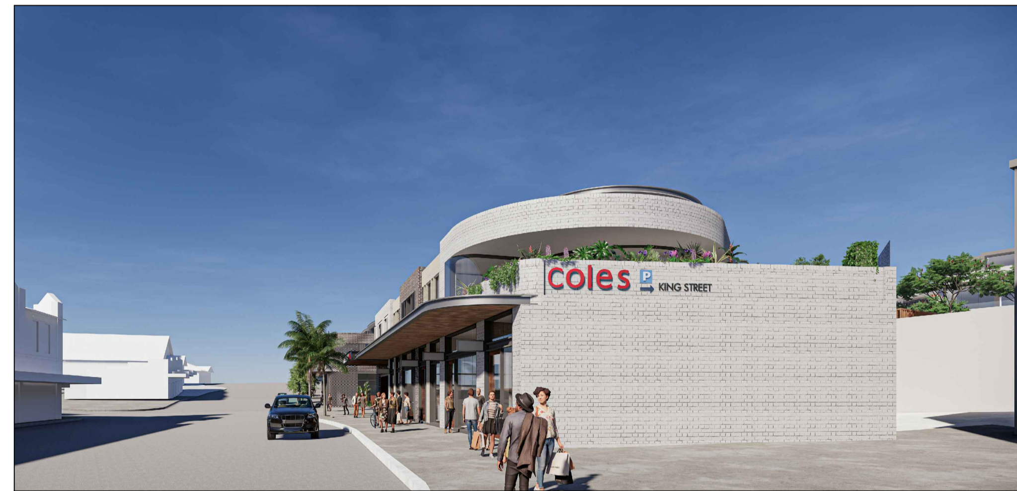
05 SIGNAGE 4 - COLES SIGNAGE TO KING ST PARKING NTS