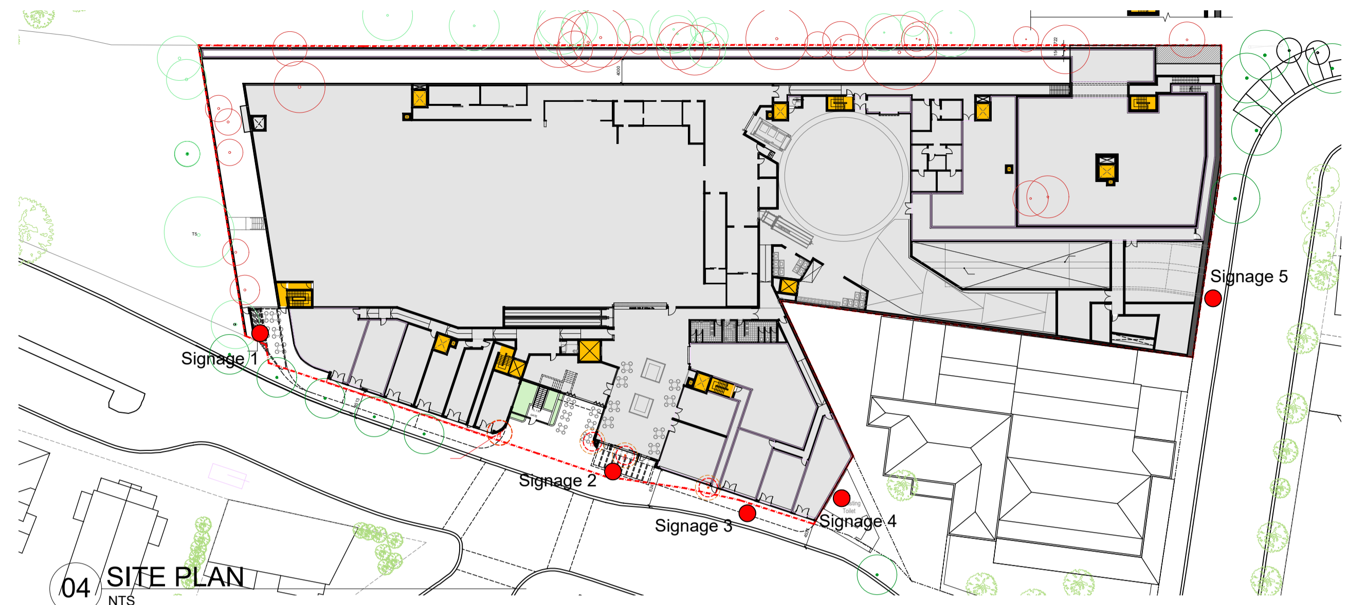
04 SITE PLAN NTS