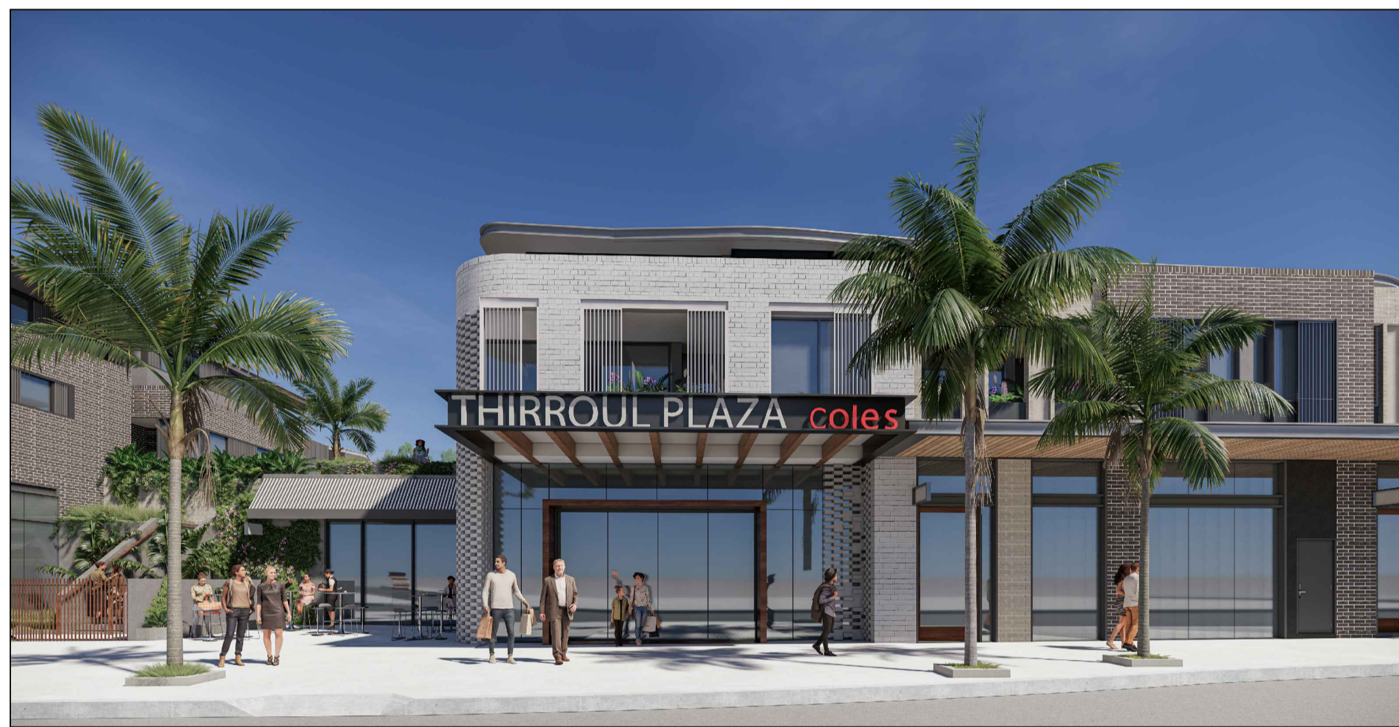
02 SIGNAGE 2 - CENTRE MAIN ENTRY NTS