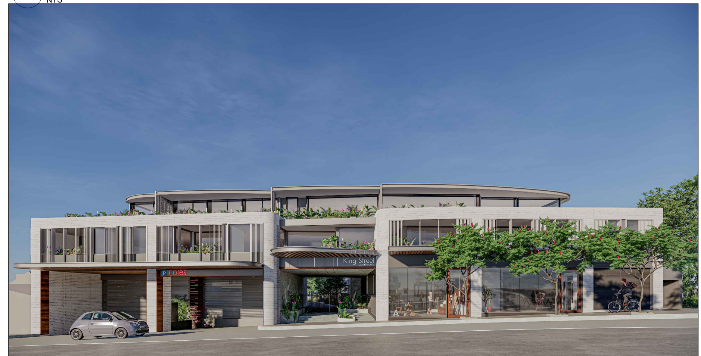
06 SIGNAGE 5 - PARKING AND KING ST. APARTMENTS ENTRY NTS